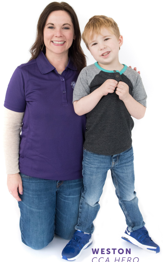
WESTON CCA HERO

Visit joyrx.org/fsp for a PDF of this Directory